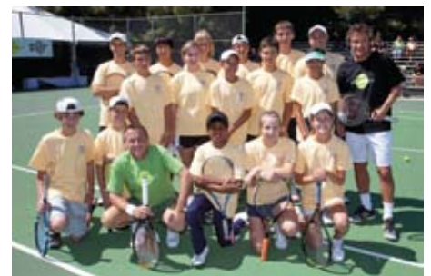
Some of the many children who took part in the Tournament